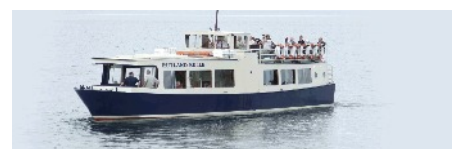
Rutland Bell Cruise